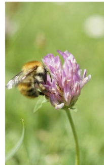
A common carder bee feeding on red clover.

Contrary to popular belief, honey bees play a fairly small role in plant pollination. Wild pollinators like bumblebees, butterflies and moths pollinate most of our food crops and also ensure the survival of wild plants. The drastic decline in pollinators is connected to habitat loss, intensive farming, urbanisation and heavy use of chemicals for pest control.